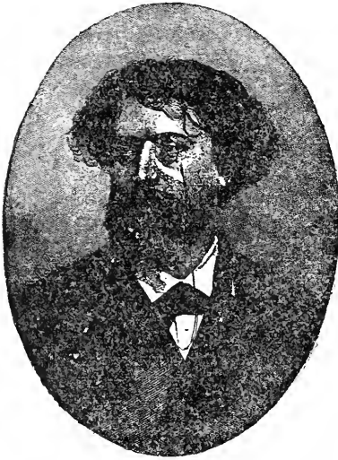
ALPHONSE DAUDET In 1885.

From an etching in Les Célébrités Contemporaines .